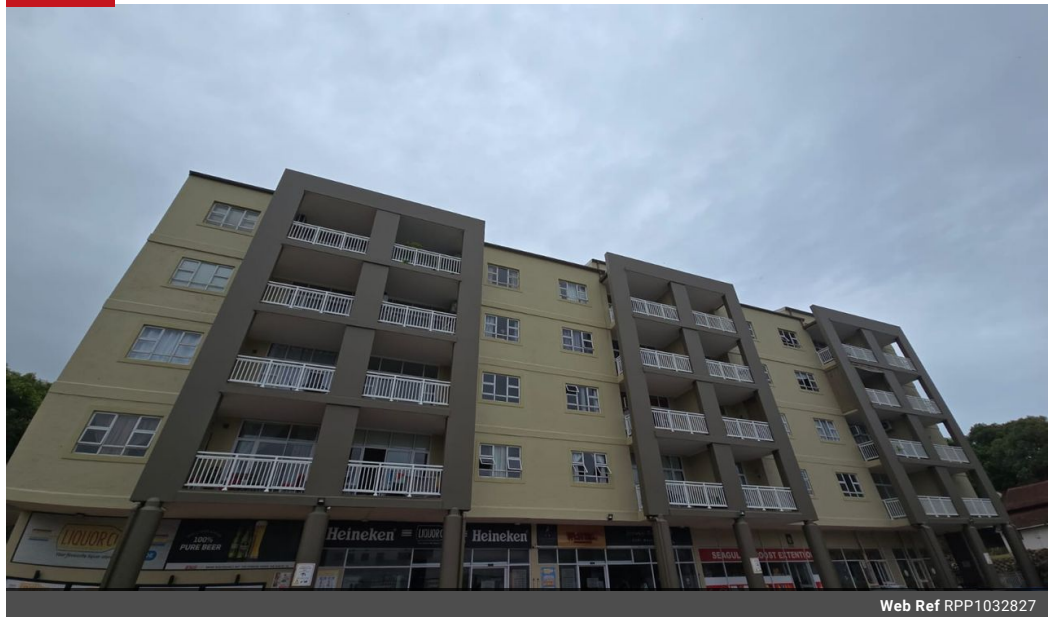
Web Ref RPP1032827