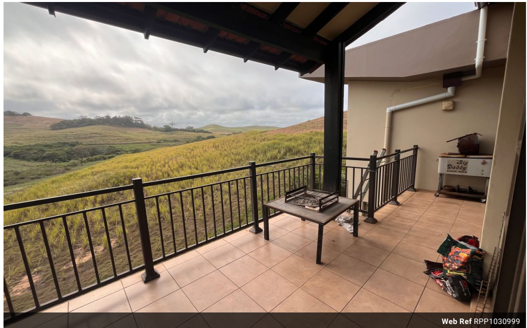
Web Ref RPP1030999

Shop 5 7 on Millennium Boulevard Umhlanga Ridge 4321