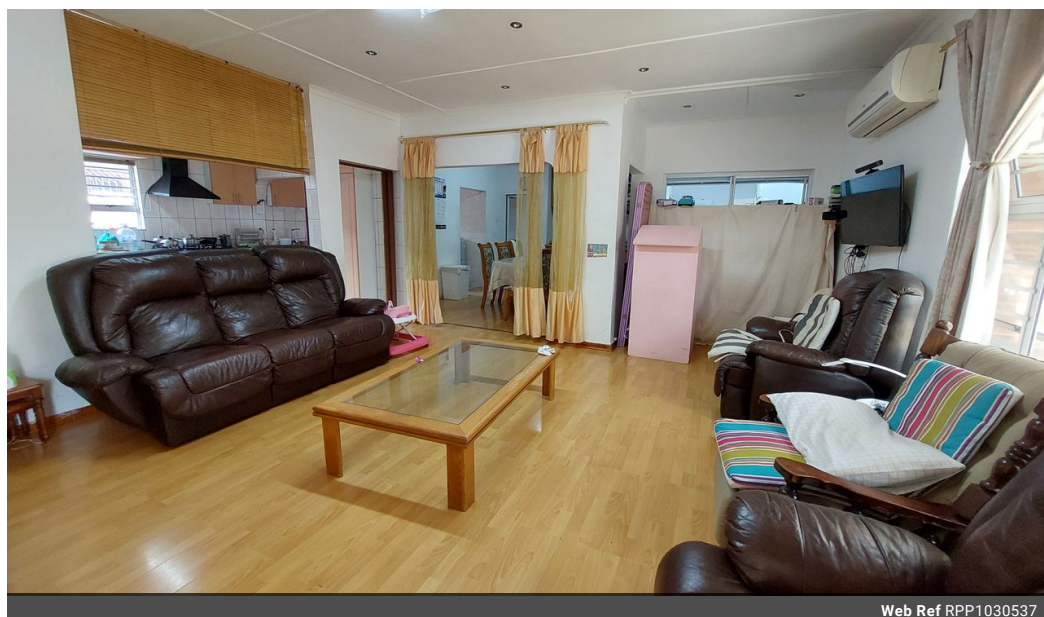
Web Ref RPP1030537

Shop 5 7 on Millennium Boulevard Umhlanga Ridge 4321