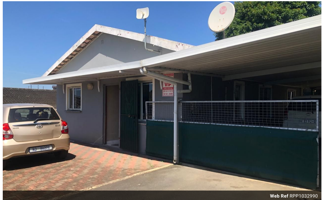
Web Ref RPP1032990

Shop 5 7 on Millennium Boulevard Umhlanga Ridge 4321