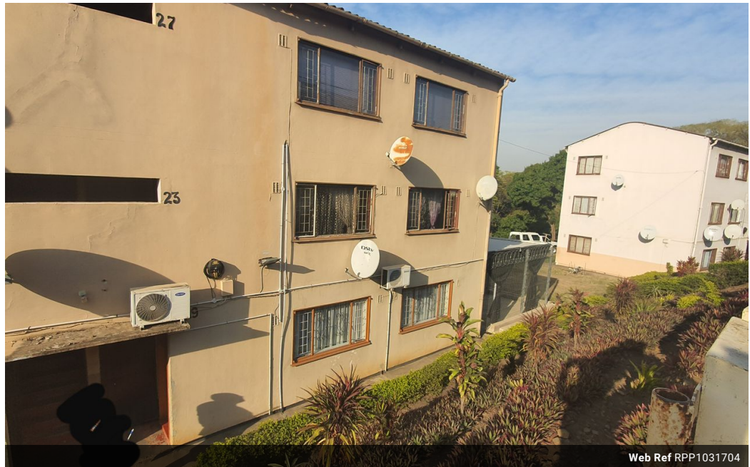
Web Ref RPP1031704

Shop 5 7 on Millennium Boulevard Umhlanga Ridge 4321