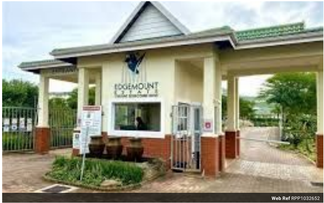
Web Ref RPP1032652

Shop 5 7 on Millennium Boulevard Umhlanga Ridge 4321