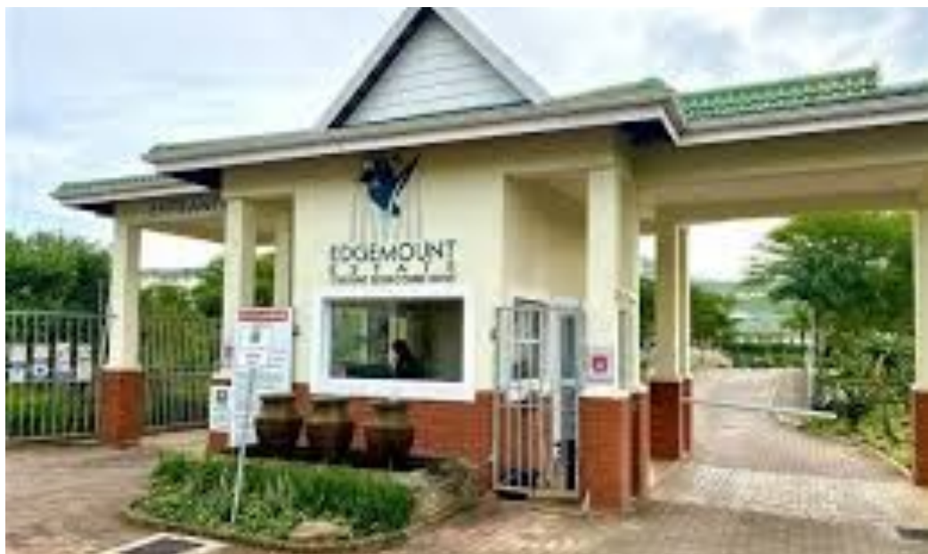
Web Ref RPP1031993

Shop 5 7 on Millennium Boulevard Umhlanga Ridge 4321