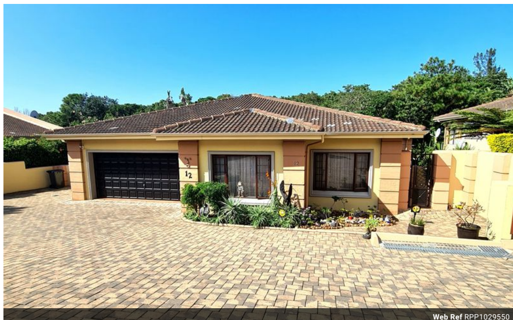
Web Ref RPP1029550