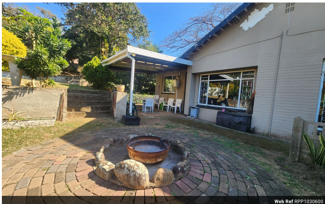
Web Ref RPP1030600