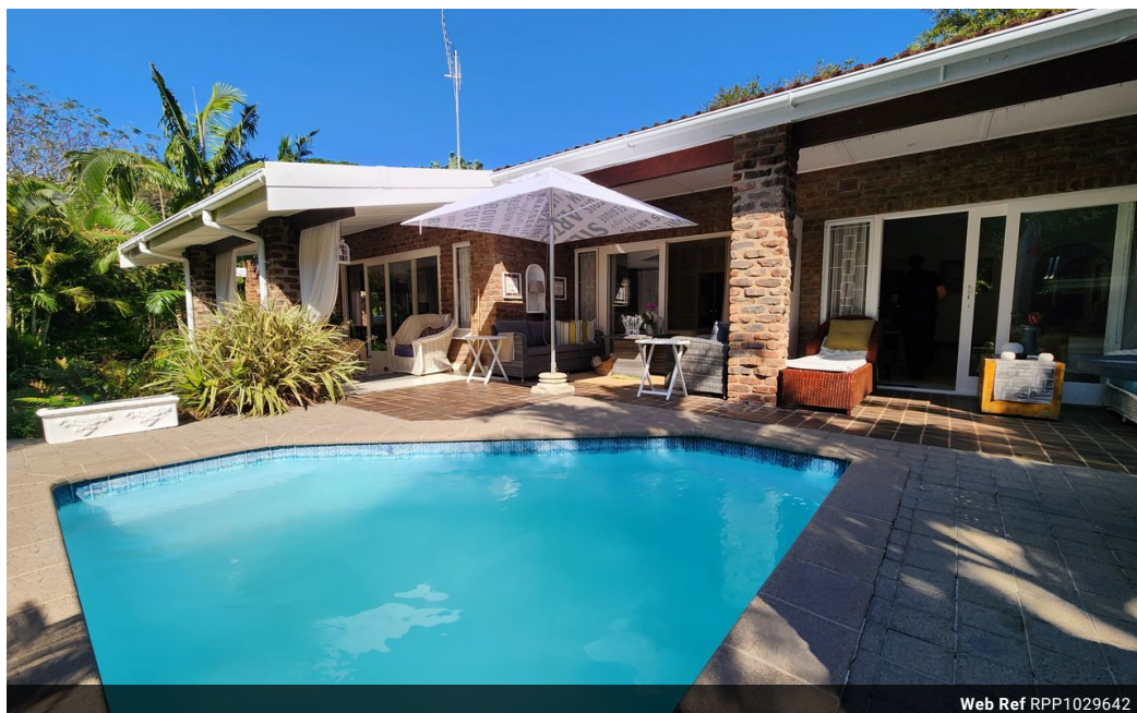
Web Ref RPP1029642