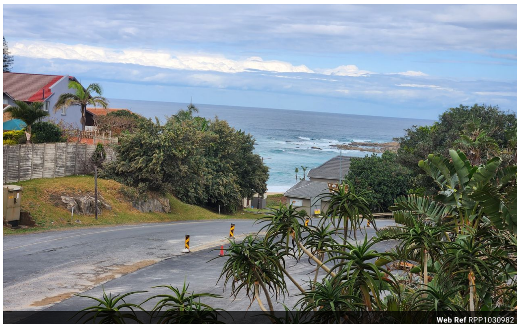
Web Ref RPP1030982