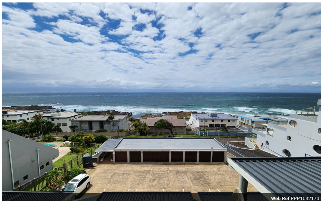
Web Ref RPP1032170