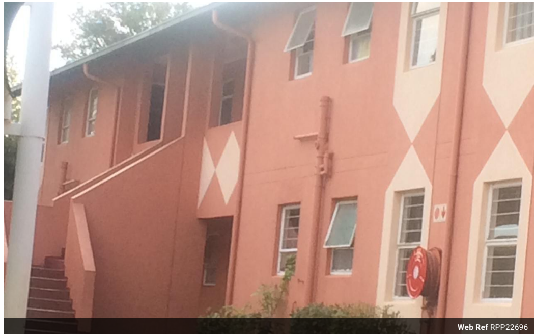
Web Ref RPP22696

28 Augrabies Road Waterfall Park Midrand Johannesburg