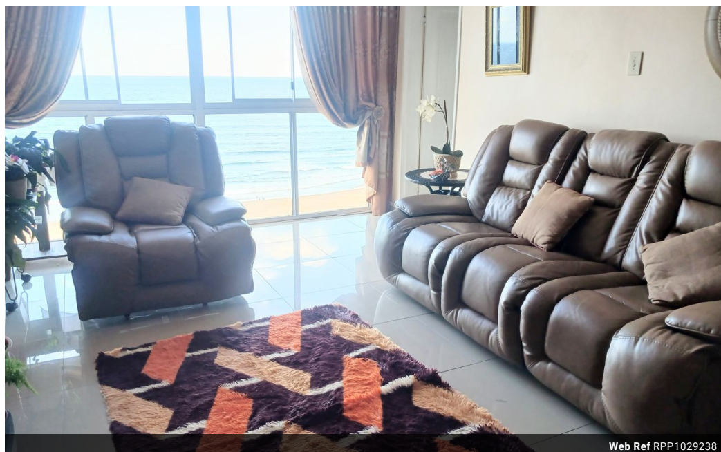
Web Ref RPP1029238

Shop 5 7 on Millennium Boulevard Umhlanga Ridge 4321