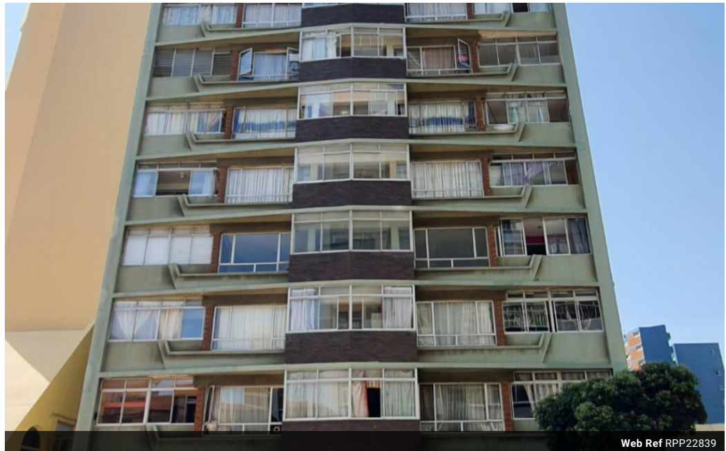
Web Ref RPP22839

Shop 5, 7 on Millennium 7 Millennium Boulevard Umhlanga 4319