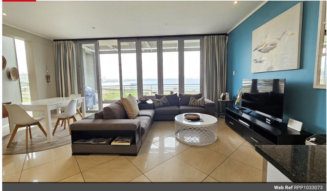
Web Ref RPP1033073