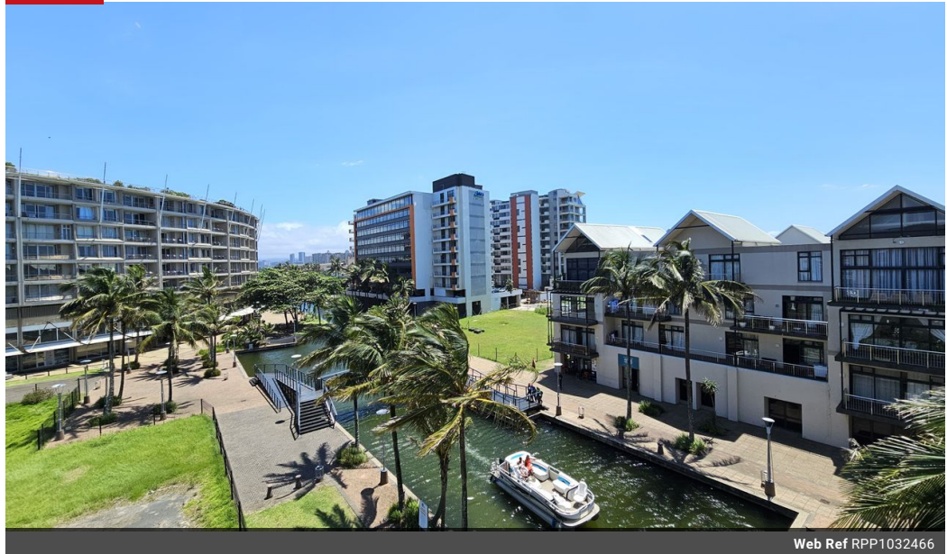
Web Ref RPP1032466