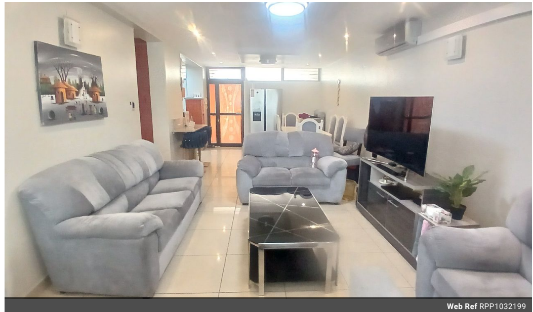
Web Ref RPP1032199

Shop 5 7 on Millennium Boulevard Umhlanga Ridge 4321