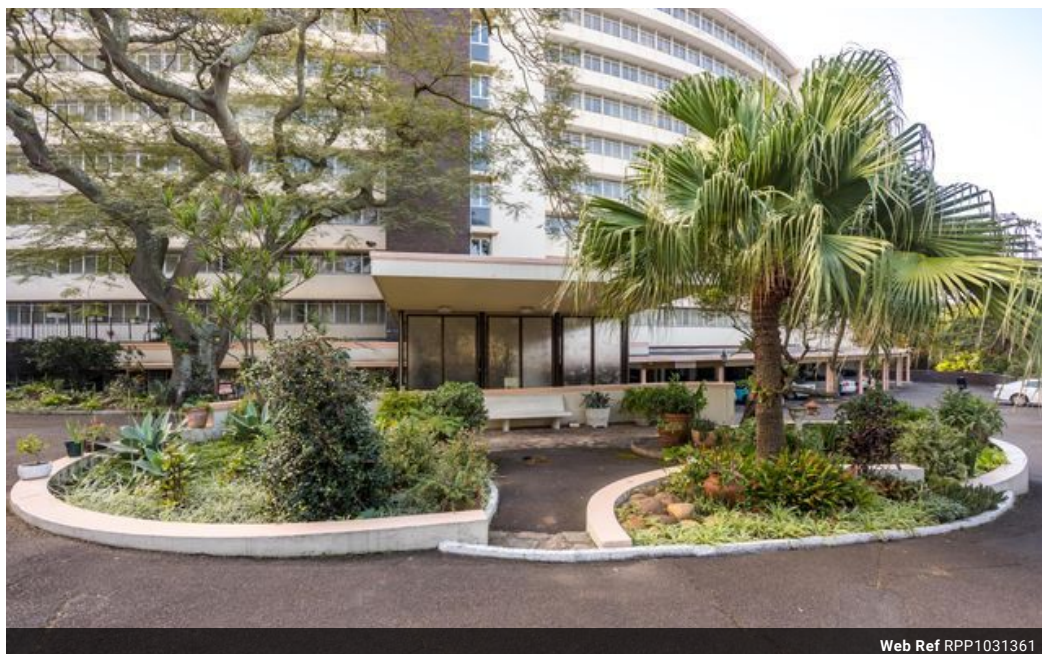
Web Ref RPP1031361

Shop 5 7 on Millennium Boulevard Umhlanga Ridge 4321