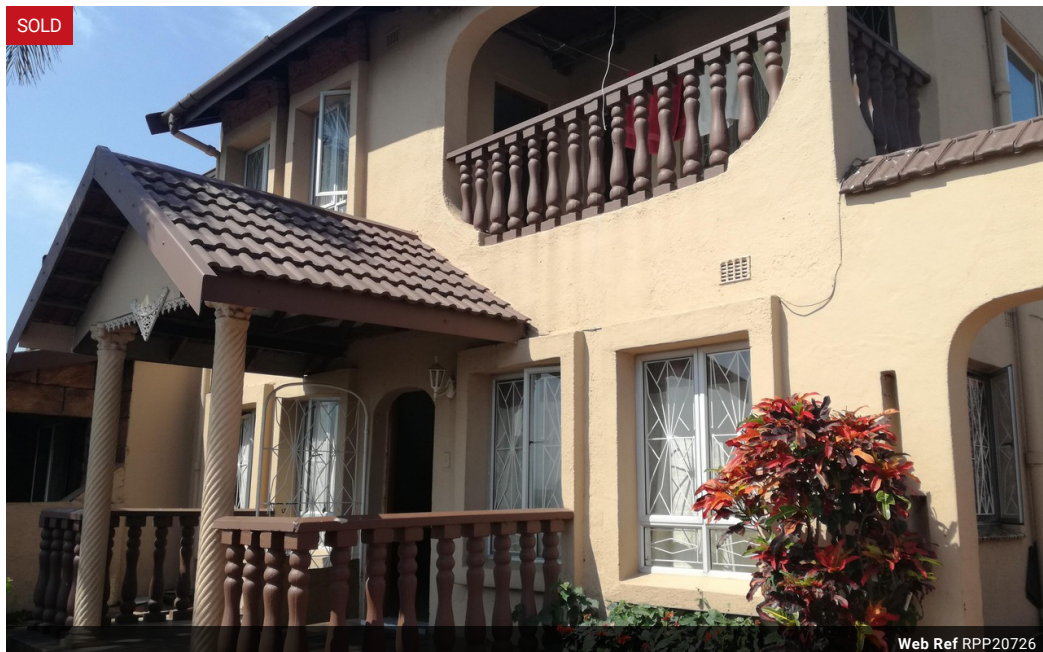
Web Ref RPP20726

Shop 5 7 on Millennium Boulevard Umhlanga Ridge 4321