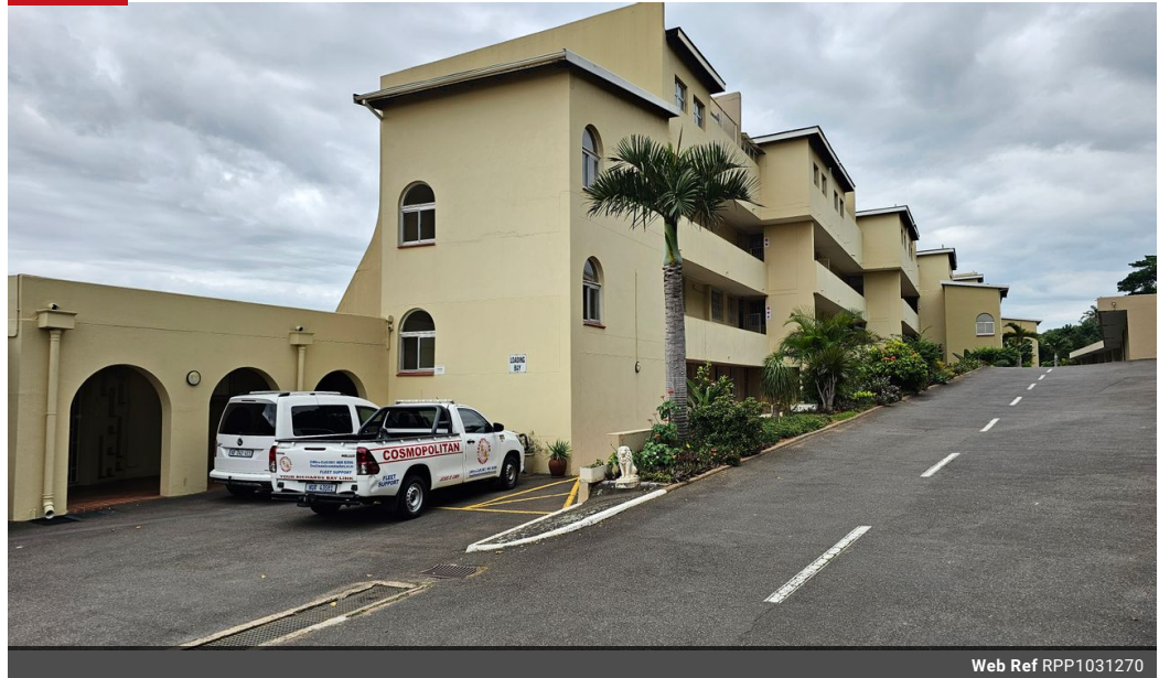
Web Ref RPP1031270