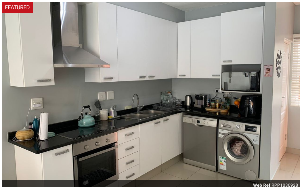
Web Ref RPP1030928

Shop 5 7 on Millennium Boulevard Umhlanga Ridge 4321