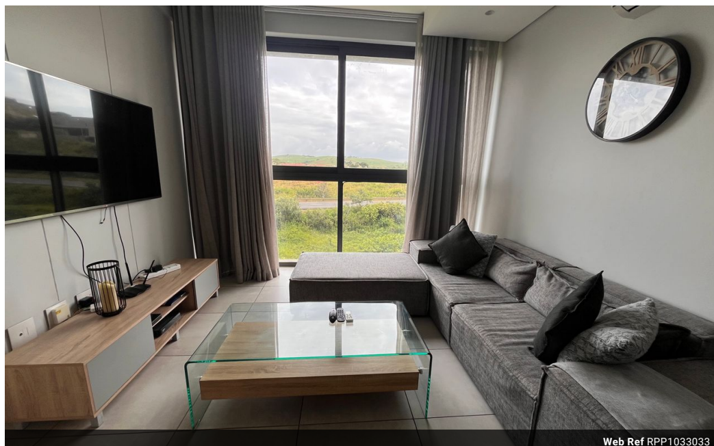
Web Ref RPP1033033

Shop 5 7 on Millennium Boulevard Umhlanga Ridge 4321