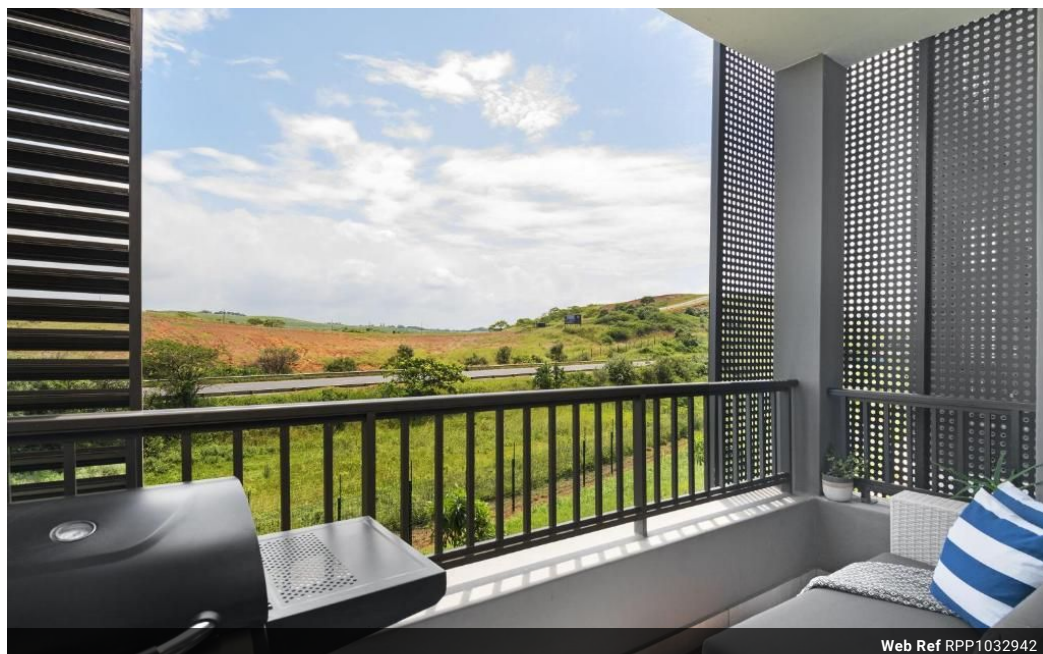
Web Ref RPP1032942

Shop 5 7 on Millennium Boulevard Umhlanga Ridge 4321