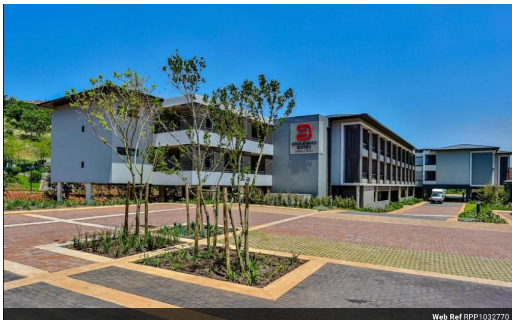
Web Ref RPP1032770

Shop 5 7 on Millennium Boulevard Umhlanga Ridge 4321