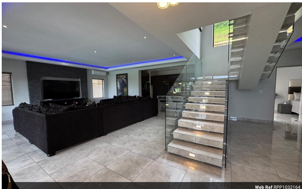
Web Ref RPP1032164

Shop 5 7 on Millennium Boulevard Umhlanga Ridge 4321