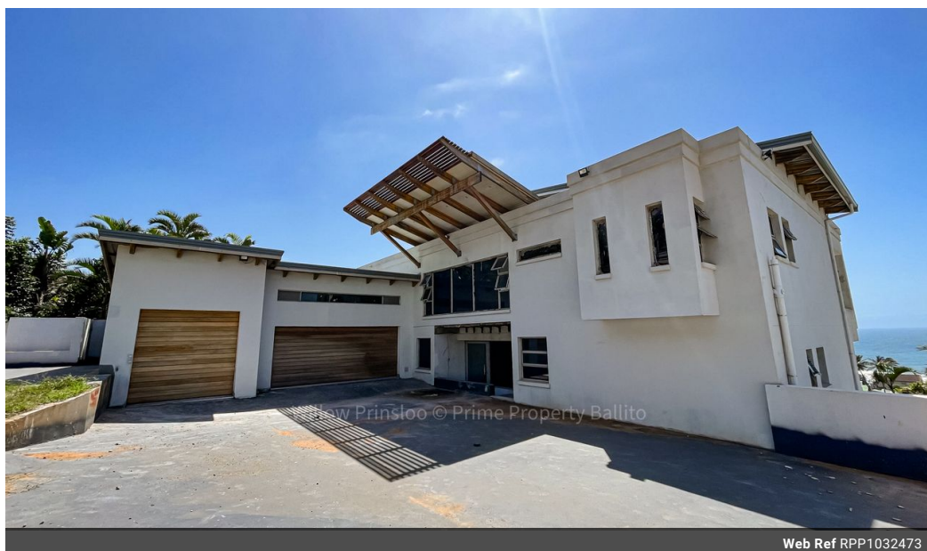
Web Ref RPP1032473

Shop 5 7 on Millennium Boulevard Umhlanga Ridge 4321