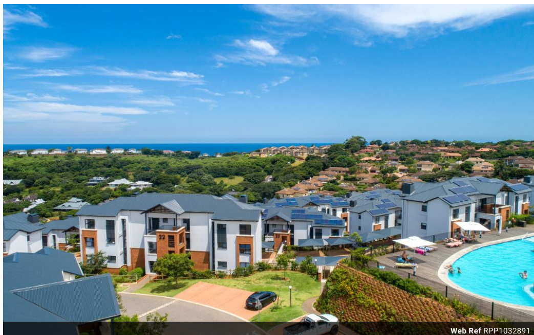
Web Ref RPP1032891

Shop 5 7 on Millennium Boulevard Umhlanga Ridge 4321