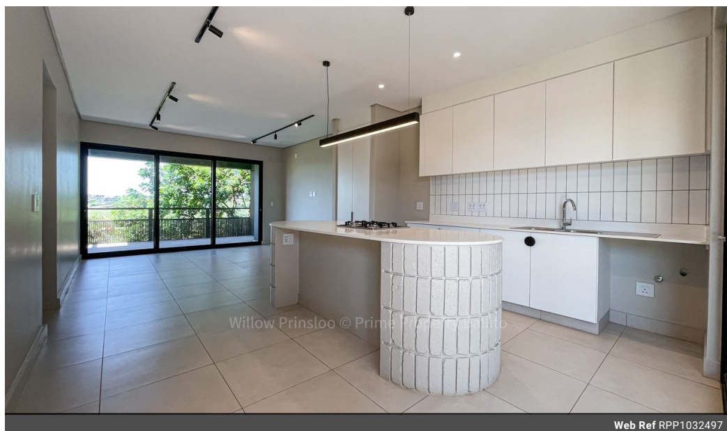
Web Ref RPP1032497

Shop 5 7 on Millennium Boulevard Umhlanga Ridge 4321