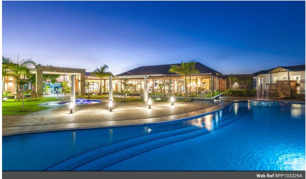
Web Ref RPP1032294

Shop 5 7 on Millennium Boulevard Umhlanga Ridge 4321