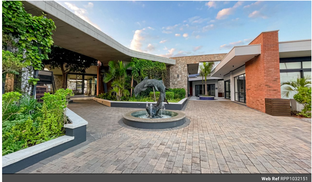
Web Ref RPP1032151

Shop 5 7 on Millennium Boulevard Umhlanga Ridge 4321