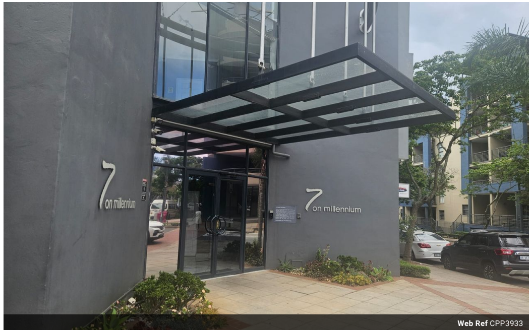
Web Ref CPP3933

Shop 5 7 on Millennium Boulevard Umhlanga Ridge 4321