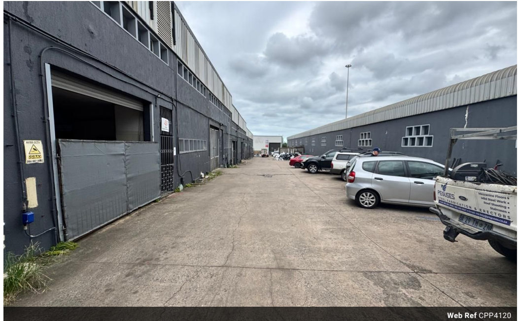
Web Ref CPP4120

Shop 5 7 on Millennium Boulevard Umhlanga Ridge 4321