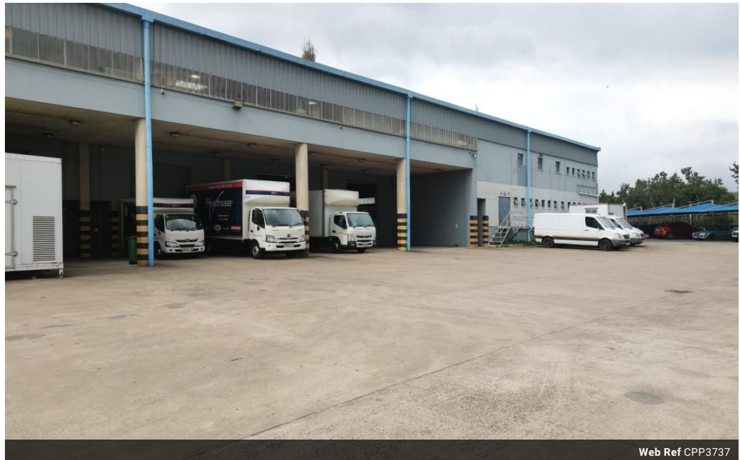
Web Ref CPP3737

Shop 5 7 on Millennium Boulevard Umhlanga Ridge 4321