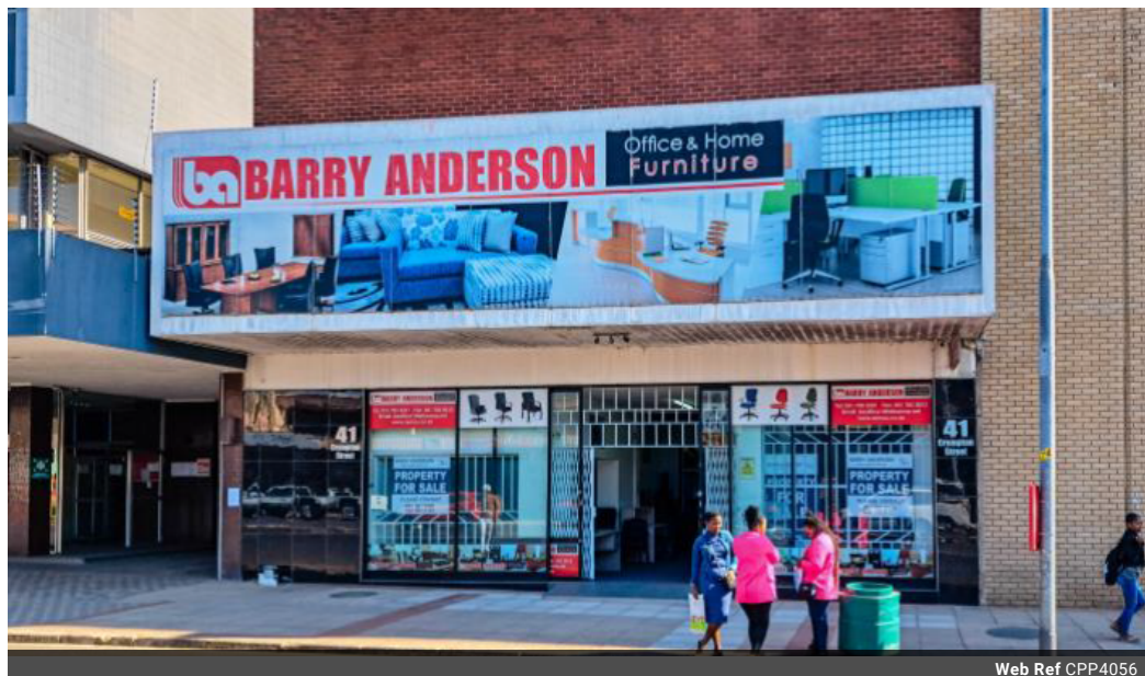
Web Ref CPP4056

Shop 5 7 on Millennium Boulevard Umhlanga Ridge 4321