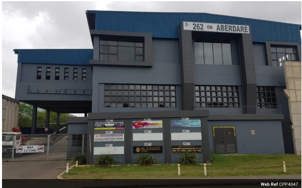
Web Ref CPP4047

Shop 5 7 on Millennium Boulevard Umlhanga Ridge 4321