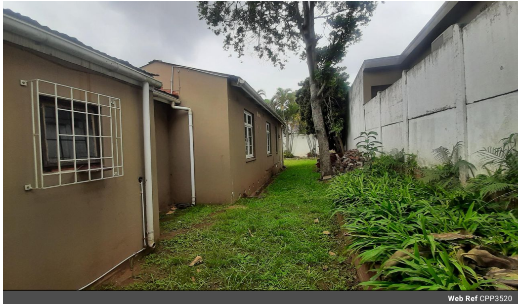
Web Ref CPP3520

Shop 5 7 on Millennium Boulevard Umhlanga Ridge 4321