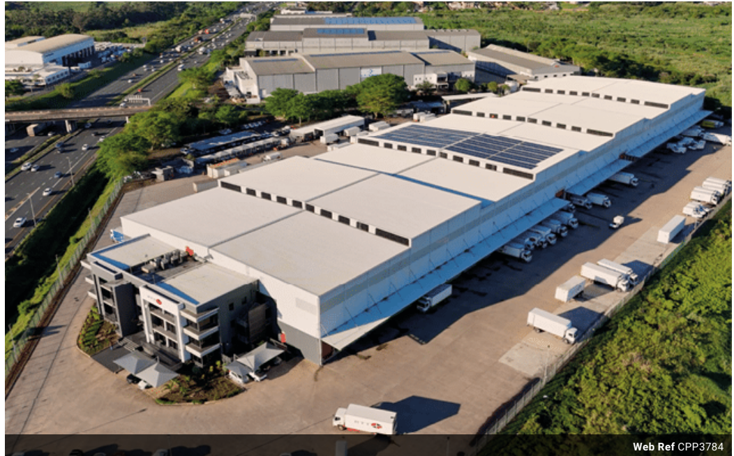
Web Ref CPP3784

Shop 5 7 on Millennium Boulevard Umhlanga Ridge 4321