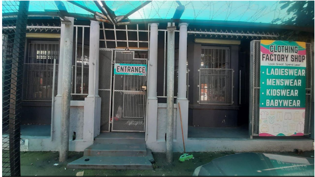
Web Ref CPP4078

Shop 5 7 on Millennium Boulevard Umhlanga Ridge 4321