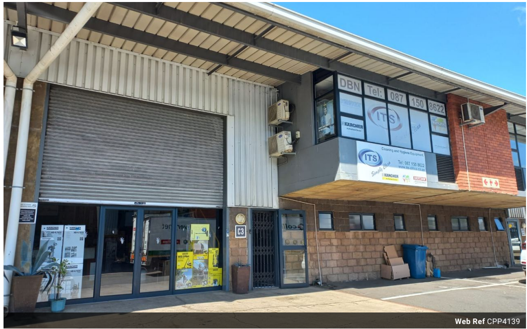
Web Ref CPP4139

Shop 5 7 on Millennium Boulevard Umhlanga Ridge 4321