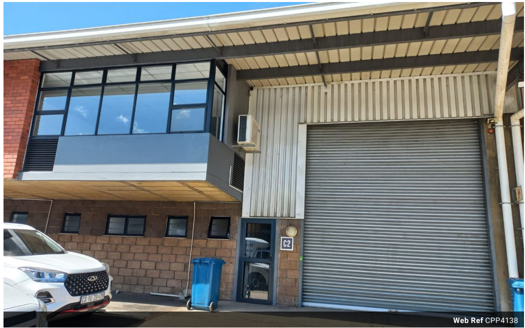
Web Ref CPP4138

Shop 5 7 on Millennium Boulevard Umhlanga Ridge 4321