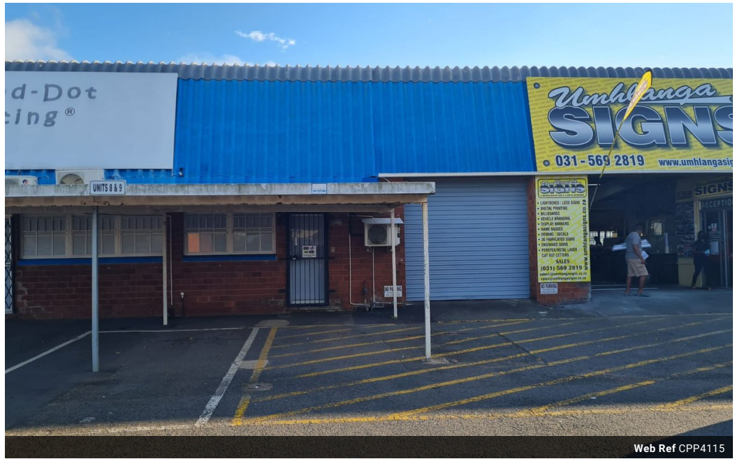
Web Ref CPP4115

Shop 5 7 on Millennium Boulevard Umhlanga Ridge 4321