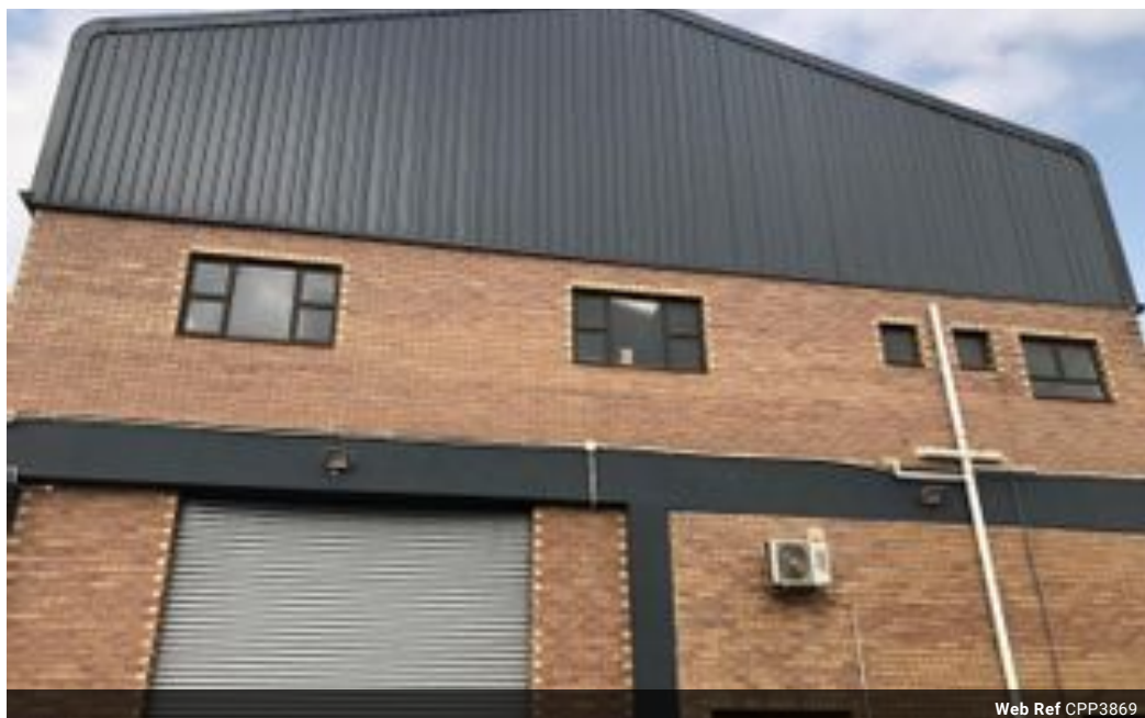
Web Ref CPP3869

Shop 5 7 on Millennium Boulevard Umhlanga Ridge 4321