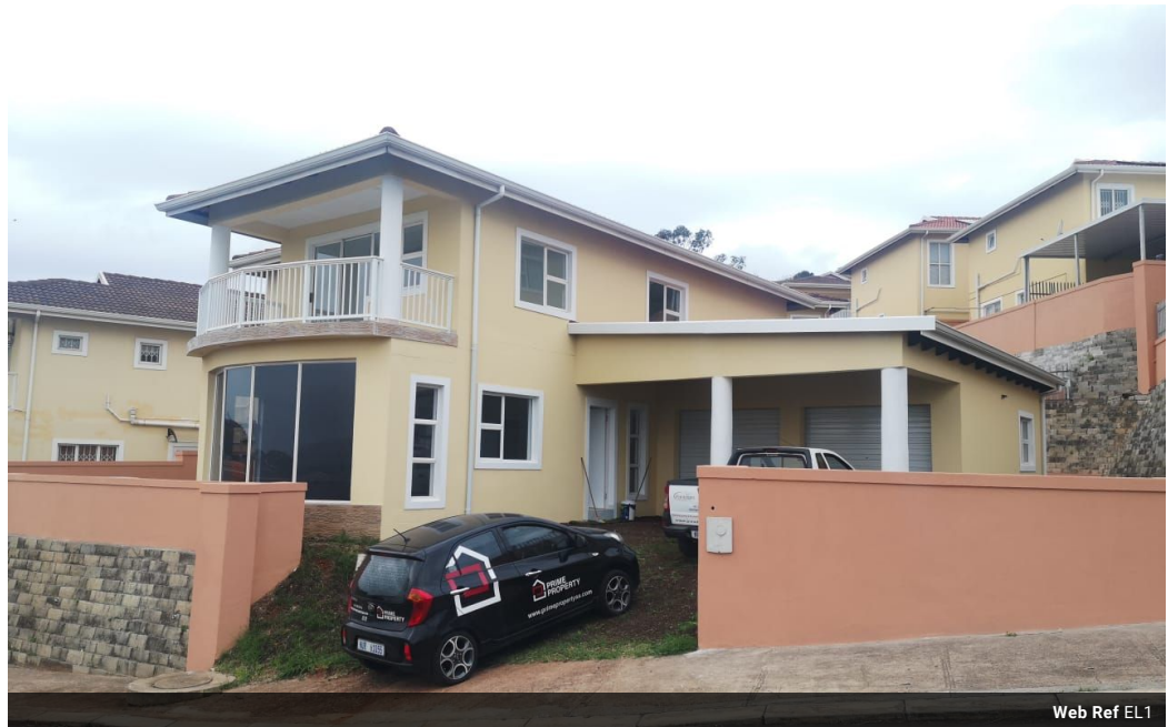
Web Ref EL1

Shop 5 7 on Millennium Boulevard Umhlanga Ridge 4321