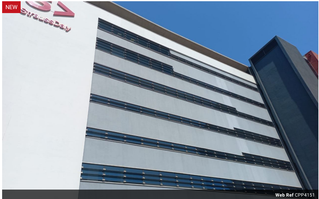
Web Ref CPP4151

Shop 5 7 on Millennium Boulevard Umhlanga Ridge 4321