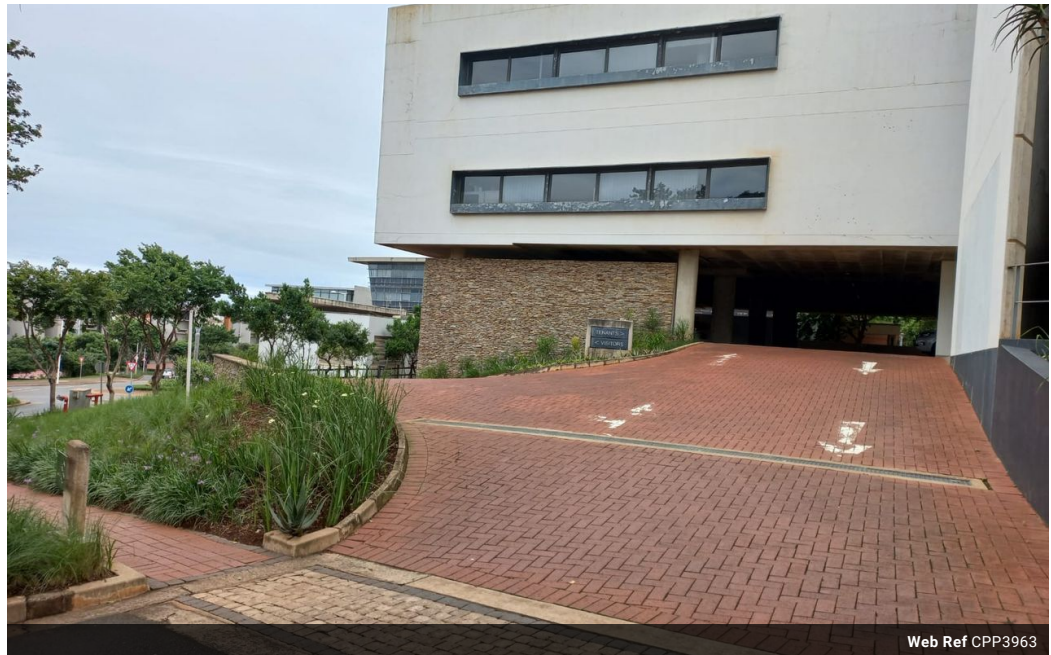
Web Ref CPP3963

Shop 5 7 on Millennium Boulevard Umhlanga Ridge 4321