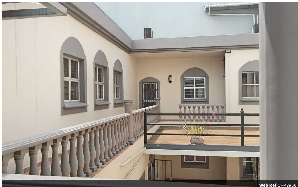
Web Ref CPP3956

Shop 5 7 on Millennium Boulevard Umhlanga Ridge 4321