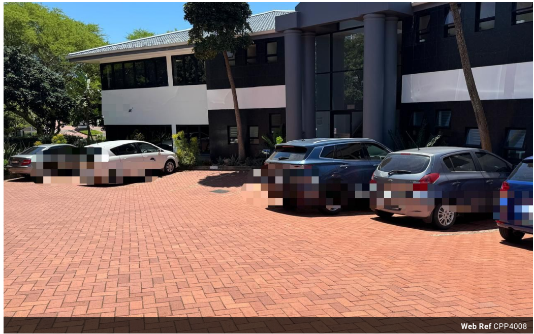
Web Ref CPP4008

Shop 5 7 on Millennium Boulevard Umhlanga Ridge 4321