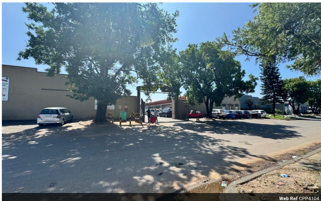
Web Ref CPP4104

Shop 5 7 on Millennium Boulevard Umhlanga Ridge 4321