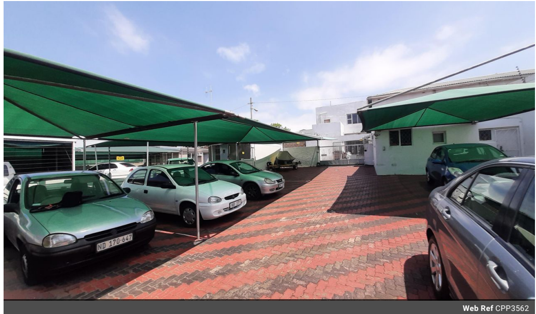
Web Ref CPP3562

Shop 5 7 on Millennium Boulevard Umhlanga Ridge 4321